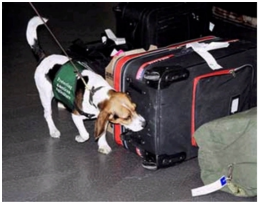
Member of the U.S. Customs & Border Protection Beagle Brigade inspecting luggage for agriculture contraband.

Medical tests have recently shown that specially trained dogs are capable of detecting certain types of tumors in humans.